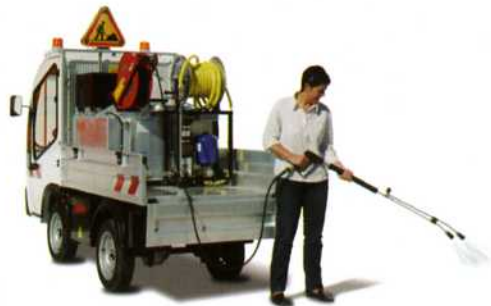
Electric watering system combined to high pressur cleaner 400l