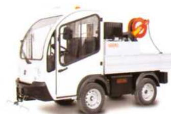
Front spray boom*